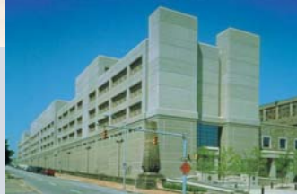
Boulder County Jail, Boulder County, Colorado 1987 Architecture for Justice Exhibition Architect: Lescher & Mahoney Inc./DLR Group