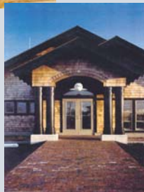
Oswego County Public Safety Center, Oswego County, New York 1991-1992 Architecture for Justice Exhibition Architect: JCM Architectural Associates