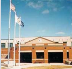
Sarpy County Law Enforcement Center, Sarpy County, Nebraska 1989 Architecture for Justice Exhibition Architect: DLR Group