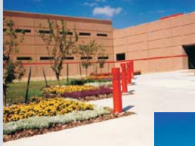
Dodge County Judicial Center, Dodge County, Nebraska 1985 Architecture for Justice Exhibition Architect: Dana Larson Roubal

Voorhis Associates, Inc. provided master planning, pre-architectural programming, design assistance, and / or transition services to these projects that received recognition from the American Institute of Architects Committee on Architecture for Justice.