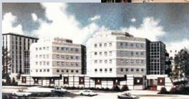
Montgomery County Jail, Montgomery County, Ohio 1994-1995 Justice Facilities Review Architect: Levin Porter Associates, Inc.