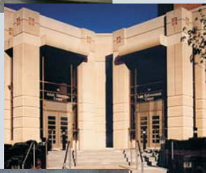
Mesa County Justice Center, Mesa County, Colorado 1993-1994 Justice Facilities Review Architect: Henningson, Durham & Richardson, Inc.